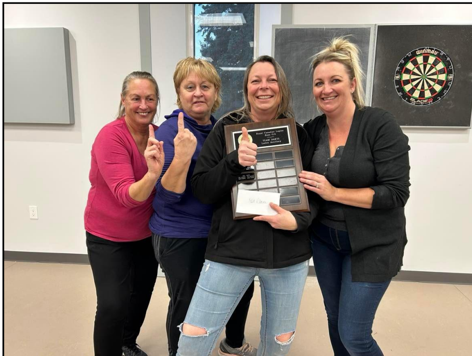
1 st place team

RED FRIDAYS - Please show your support for our troops and their families and to the families of the 158 soldiers killed in Afghanistan, by WEARING RED ON FRIDAYS.