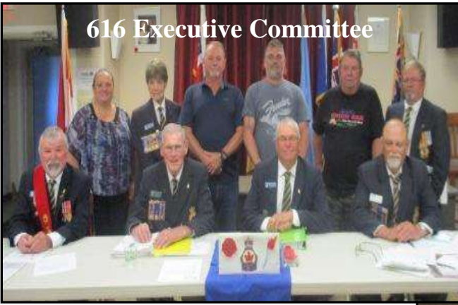
616 Executive Committee