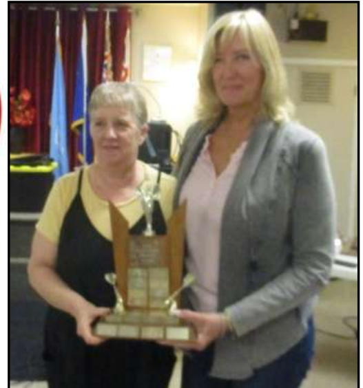
1 st Place in Playoffs