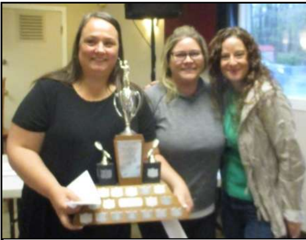
1 st Place in Season Darts