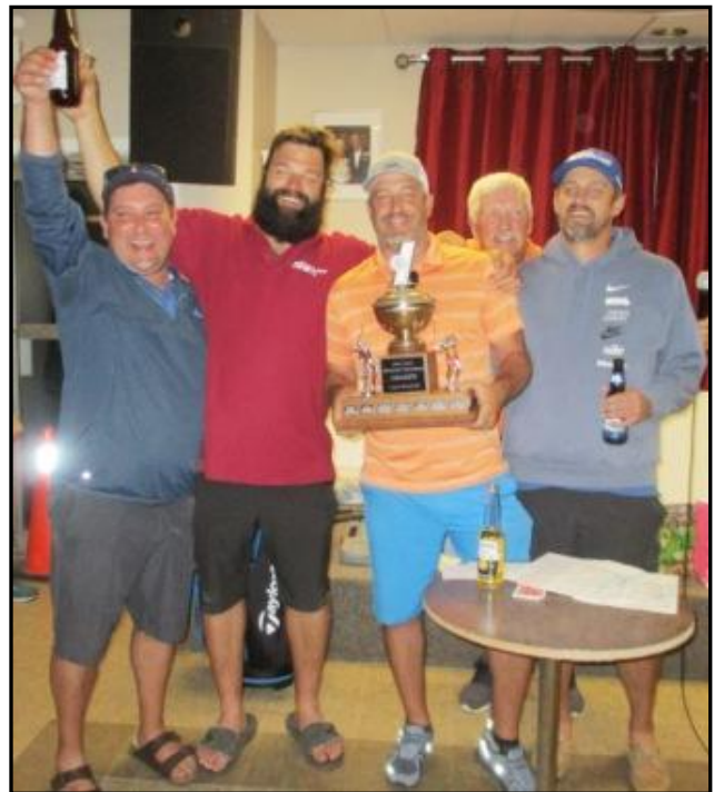
Alf Currie Memorial Golf Tournament.